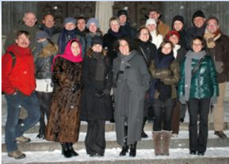
Kick-off meeting in Uppsala (S)

http://www.aer.eu/main-issues/economic-development.html