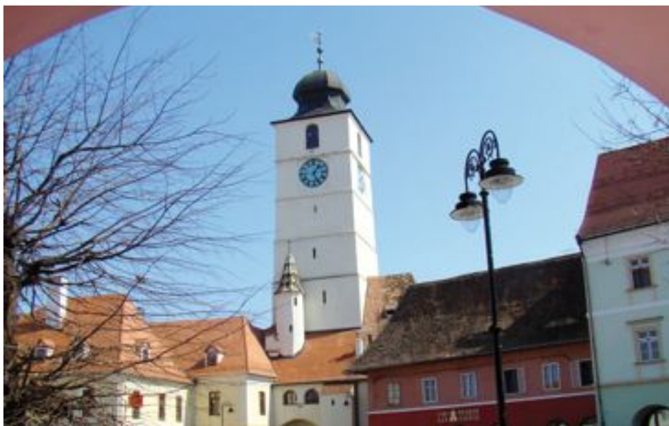
City of Sibiu (RO)