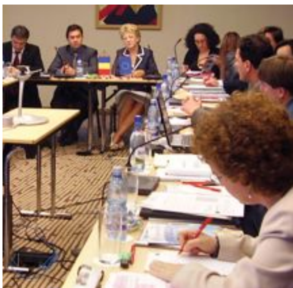
Meeting of the WG3 in Sibiu (RO)

The first day was dedicated to reviewing each partner's task and commitment and to the presentation of each working group. The second day was more focused on administrative procedures (first level control and reports) and communication aspects.