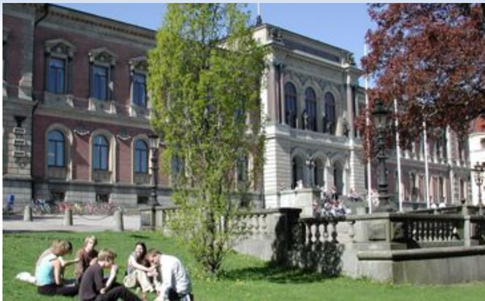
University of Uppsala (S)

Home to two prolific universities, Uppsala county has a long tradition of great thinkers and innovators. In recent years, it has become known for the production, storage and efficient use of both non-renewable and renewable energy. Many activities in relation to eco-innovation are taking place in Uppsala but there is no shared understanding of how the different stakeholders can move forward together. Within the scope of ECREIN+, Uppsala will attempt to address this matter. Looking specifically at mobilising green public procurement and fostering green activities in the business sector, Uppsala county council seeks to learn from its peers within the project and spread its experience to others regions in Europe. Participating in the ECREIN+ partnership will allow Uppsala to better tie together research potential, public sector activities and the dynamism of the business sector to promote and develop eco-innovation initiatives.